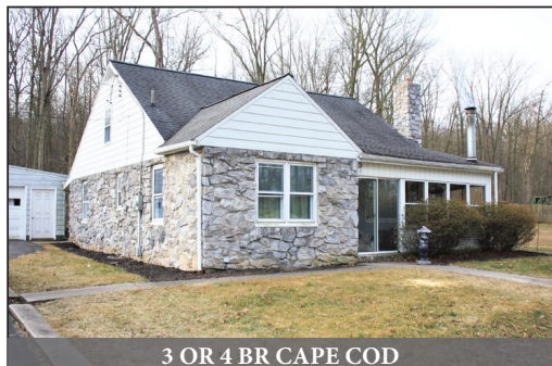
3 OR 4 BR CAPE COD

1.5 STORY HOUSE * 3 or 4 BEDROOMS * NICE DETACHED, 3-BAY 40'x 27' SHOP * .71 ACRE LOT THURSDAY, MAY 14, 2020 @ 6:30 PM