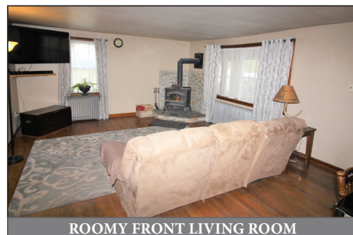
ROOMY FRONT LIVING ROOM

Located at 702 Smokestown Rd. Denver Pa. 17517