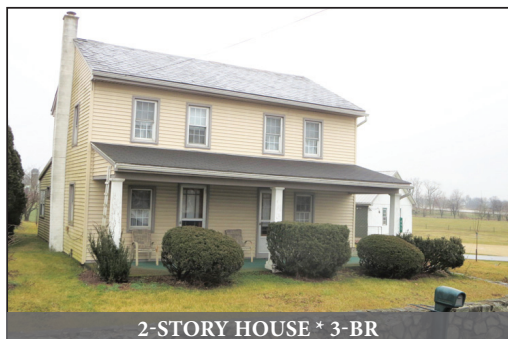
2-STORY HOUSE * 3-BR