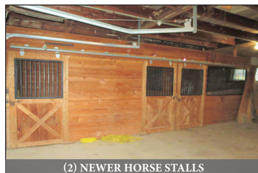
(2) NEWER HORSE STALLS

Located at 498 Gristmill Rd. Ephrata, Pa. 17522