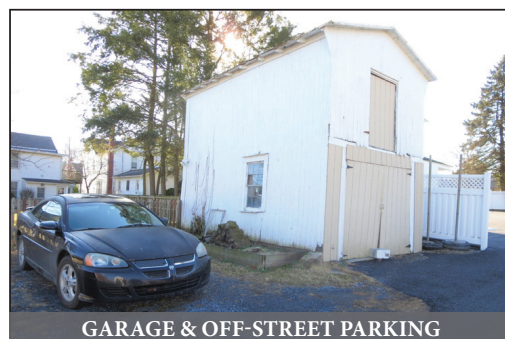
GARAGE & OFF-STREET PARKING

Located at 34 N. 9th St. Akron Pa. 17501