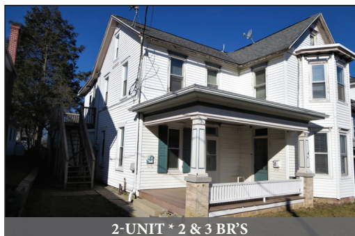
2-UNIT * 2 & 3 BR'S