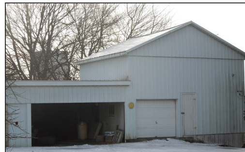
2-STORY GARAGE/BARN w/HORSE STALL

Located at 32 Cocalico Creek Rd. Ephrata, Pa. W. Earl Twp. Lancaster Co.