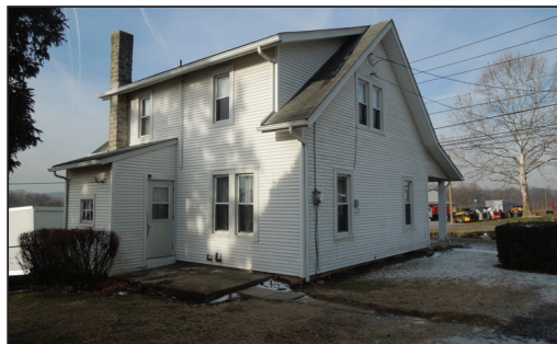
1,248 SQ. FT. 3-BEDROOM HOME