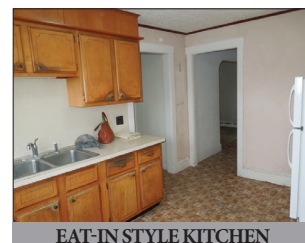
EAT-IN STYLE KITCHEN

REAL ESTATE: consists of a 1,248 sq. ft. 3-bdrm 1.5 story frame dwelling (needs interior cosmetic TLC) & 2-story barn w/attached 2-bay garage on a level 1.06 ac. lot. Main floor features a wood cabinet kitchen w/fridge & range; 12'x13' dining room; 13'x20' living room; open staircase; covered front porch; enclosed rear porch/mud room w/upright freezer & sink; upper level includes 3-bedrooms & full bath; basement is unimproved w/walk-out door; oil furnace HW heat w/275 gallon fuel tank; laundry hook-up w/washer & dryer; shower stall; on-site well & public sewer; recent asphalt shingle roof; vinyl siding & insulated windows throughout; annual taxes: $2,857. Outbuildings: a 24'x30' frame 2-story barn/shop w/ horse stall; attached 20'x24' open front garage/shed; large pasture/garden area.