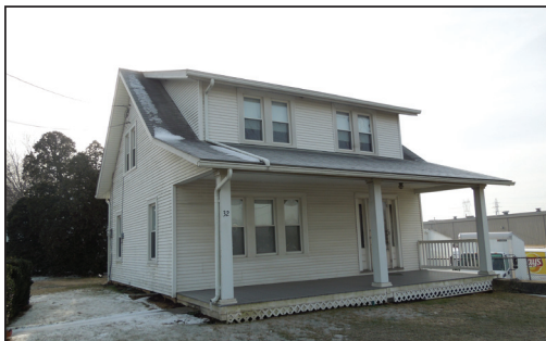
1.06 ACRES ZONED INDUSTRIAL