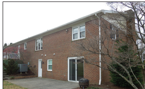
DAYLIGHT FINISHED BASEMENT

Located at 146 Ebersole Rd. Ephrata, Pa. E. Cocalico Twp. Lancaster Co.