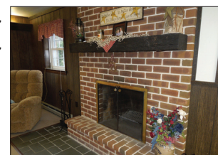
FAMILY RM W/BRICK FP

OPEN HOUSE: SAT. FEB. 29 & MARCH 7 from 1-3 PM for info call auctioneer @ (717) 371-3333