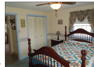
MASTER SUITE & BATH