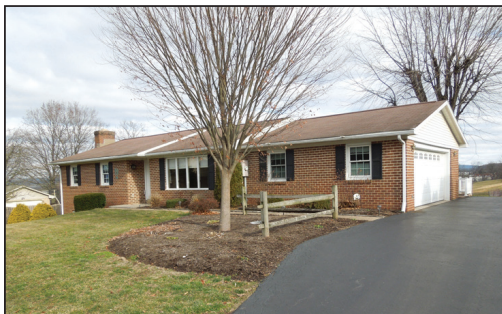
4-BR RANCHER W/2-CAR GARAGE * 1.05 AC.