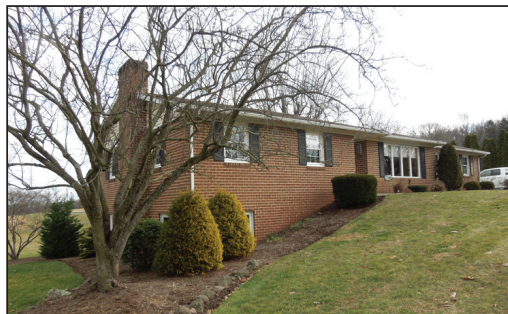
CUSTOM ALL BRICK 1,456 SQ. FT. RANCHER