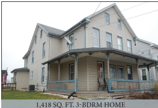
1,418 SQ. FT. 3-BDRM HOME