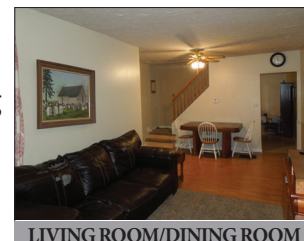
LIVING ROOM/DINING ROOM