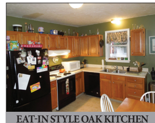
EAT-IN STYLE OAK KITCHEN

For photos & listing visit www.martinandrutt.com