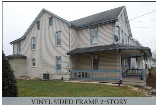
VINYL SIDED FRAME 2-STORY