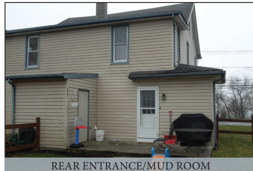
REAR ENTRANCE/MUD ROOM

Located at 218 E. Main St. Terre Hill, Pa., Lancaster Co., ELANCO Schools