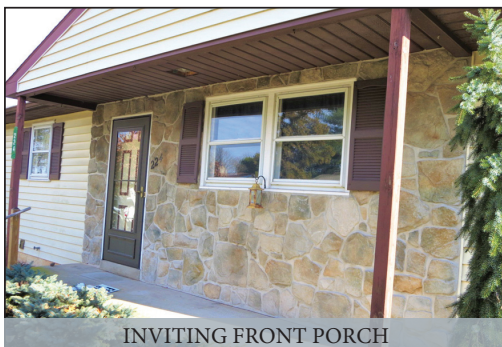
INVITING FRONT PORCH