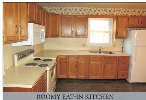
ROOMY EAT-IN KITCHEN

Located at 224 New St. Terre Hill Pa. 17581