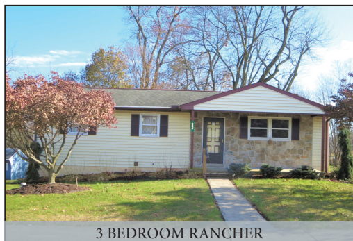
3 BEDROOM RANCHER