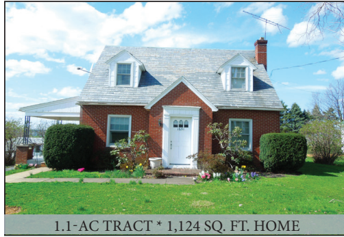
1.1-AC TRACT * 1,124 SQ. FT. HOME