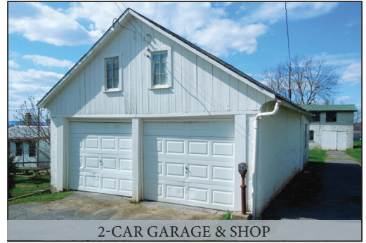
2-CAR GARAGE & SHOP

Located at 1651 Main St. East Earl, Pa. (Goodville) East Earl Twp. Lancaster Co.