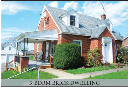
3-BDRM BRICK DWELLING