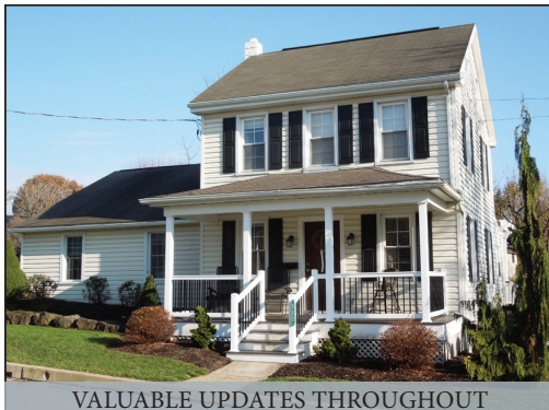
VALUABLE UPDATES THROUGHOUT