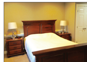
MASTER BR SUITE & BATH