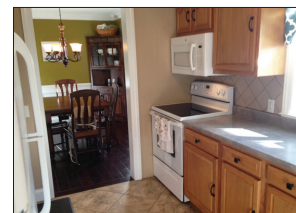
UPDATED CUSTOM KITCHEN

For photos & listing visit www.martinandrutt.com