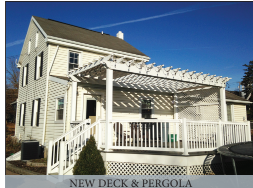
NEW DECK & PERGOLA

Located at 202 Oak Ln. Terre Hill, Pa. 17581