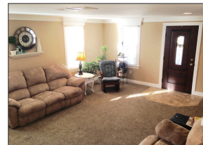
LIVING ROOM W/CROWN MOLDING