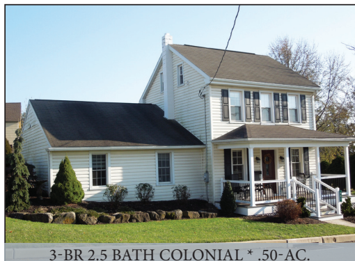
3-BR 2.5 BATH COLONIAL * .50-AC.

3-BDRM 2.5 BATH 2-STORY COLONIAL * .50-ACRE LOT CUSTOM KITCHEN * NEW DECK & PERGOLA * UTILITY SHED SATURDAY, FEB. 1, 2020 @ 10-AM