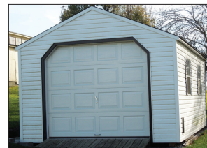
12'X16' UTILITY SHED W/GARAGE DOOR