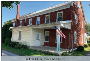
4 UNIT APARTMENTS