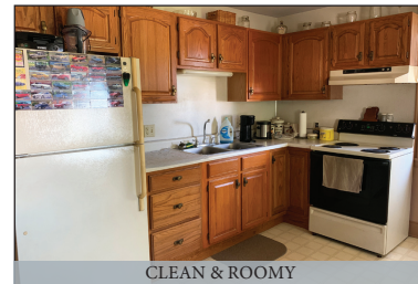
CLEAN & ROOMY

Located at 400-408 Linden Grove Rd. New Holland Pa. 17557