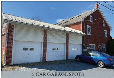
5 CAR GARAGE SPOTS