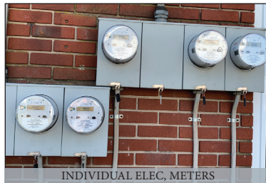
INDIVIDUAL ELEC. METERS