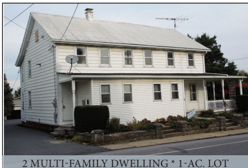
2 MULTI-FAMILY DWELLING * 1-AC. LOT