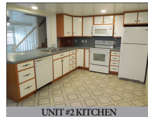
UNIT #2 KITCHEN