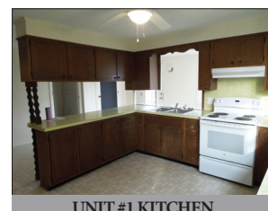
UNIT #1 KITCHEN

REAL ESTATE: consists of a 3,360 sq. ft. multi-unit 2-story apartment dwelling & garage on a spacious 1-acre lot. Unit #1: (east side) main floor features a breakfast nook; kitchen w/appliances; dining room; family room; bath; upper level includes 4-bedrooms & 2-baths. Unit #2: (west side) main floor features a family room/dining room combo w/HW flooring; updated kitchen w/appliances; master suite w/WIC full bath/laundry combo; upper level includes ½ bath & 1-bedroom. Guest Suite: (west end) upper level includes family room; partial kitchenette; full bath & 1-bedroom. Full basement w/outside entrance includes new oil furnace & wiring; on site well & septic; walk-up attic storage; annual taxes: $4,300. Outbuilding: includes a 360 sq. ft. garage/shop & finished office/hobby room; large rear yard w/space for garden or pasture.