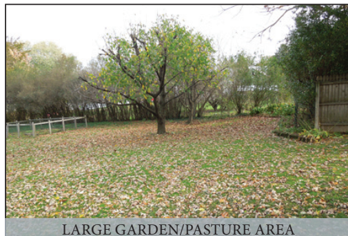
LARGE GARDEN/PASTURE AREA

Located at 1569 Main St. Goodville, Pa. East Earl Twp. Lancaster Co.