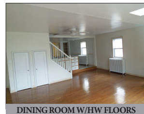
DINING ROOM W/HW FLOORS