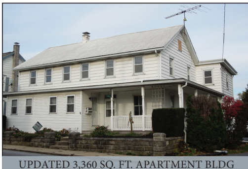
UPDATED 3,360 SQ. FT. APARTMENT BLDG