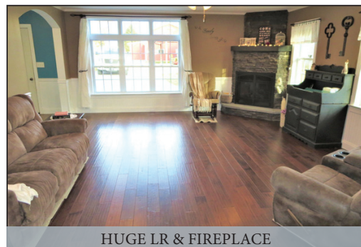
HUGE LR & FIREPLACE

Located at 304 Wissler Rd. New Holland Pa. 17557