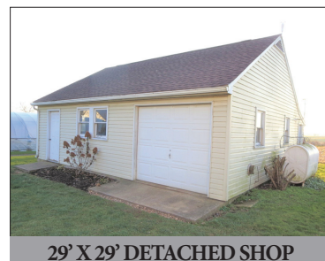
29' X 29' DETACHED SHOP

REAL ESTATE: A very clean brick/vinyl multi-level house w/ approx. 1,600 sq. ft. w/ newer horse barn & detached shop on .77 acre level lot. House includes a large eat-in style kitchen w/ nice wooden cabinetry, new vinyl flooring; patio doors out to 14'x 14' treated wood deck (2019); huge newer living room w/ LP Gas corner stone fireplace, abundant windows & hardwood flooring; mud room w/ coat hooks; newer family room w/ newer Bay style window; recreation room w/ brick hearth & includes nice coal stove; master bedroom w/ walk-in closet; 2 additional bedrooms & closets; 2 full bathrooms; powder bathroom on main level; laundry room w/ walk-out door to wash-line; lower level utility room w/ canning shelves; upgraded vinyl windows; 200 amp electric service; whole house diesel generator (49 hrs.); elec. baseboard heat; on-site well & septic; new roof in 2016; Waterfall water softener; Earl Twp.; Garden Spot School District; total taxes are approx. $3,285.00