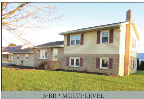
3-BR * MULTI-LEVEL