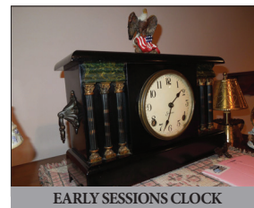
EARLY SESSIONS CLOCK