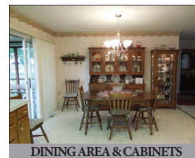
DINING AREA & CABINETS