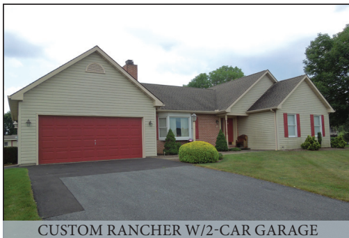
CUSTOM RANCHER W/2-CAR GARAGE