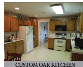
CUSTOM OAK KITCHEN