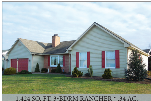
1,424 SQ. FT. 3-BDRM RANCHER * .34 AC.

3-BDRM CUSTOM RANCHER w/2-CAR GARAGE * .34-AC. LOT 2-BATHS * CUSTOM CABINETRY KITCHEN * FINISHED BASEMENT TOOLS * ANTIQUES * FURNITURE * PERSONAL PROPERTY SAT., OCTOBER 5, 2019 @ 9-AM/Real Estate @ 12 NOON