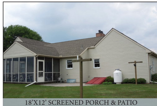
18'X12' SCREENED PORCH & PATIO

Located at 234 Hawthorn St. New Holland, Pa.