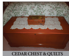
CEDAR CHEST & QUILTS