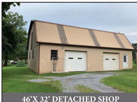
46'X 32' DETACHED SHOP