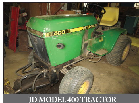
JD MODEL 400 TRACTOR

Located at: 215 S. State St. Leola (Talmage) Pa.