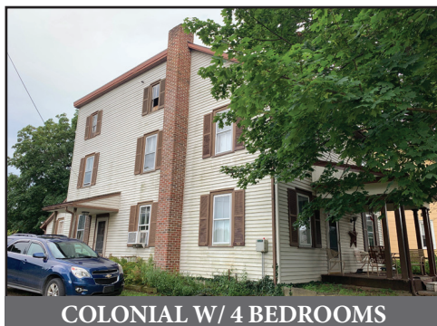
COLONIAL W/ 4 BEDROOMS

2.5-STORY HOUSE * 4-BR * HUGE KITCHEN * CLEAN .52 LEVEL ACRES * HORSE BARN/SHOP * NICE PERSONAL PROPERTY * TOOLS * TRACTOR THURSDAY, OCTOBER 3, 2019 @ 4:00 PM * R.E. @ 6:00 PM