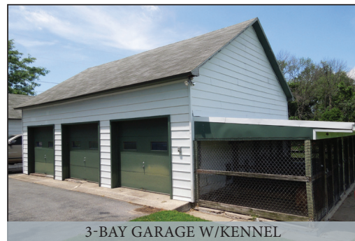
3-BAY GARAGE W/KENNEL

Located at 613 Mohns Hill Rd. Sinking Spring (Reading) PA 19608 Spring Twp. Berks Co. Wilson SD