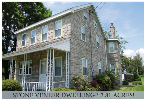
STONE VENEER DWELLING * 2.81 ACRES!