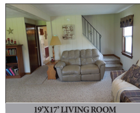
19'X17' LIVING ROOM