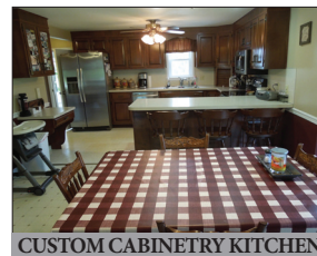
CUSTOM CABINETRY KITCHEN