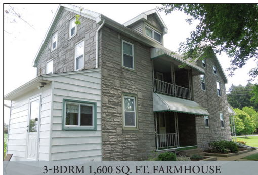
3-BDRM 1,600 SQ. FT. FARMHOUSE