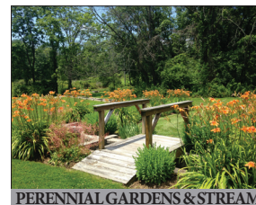
PERENNIAL GARDENS & STREAM