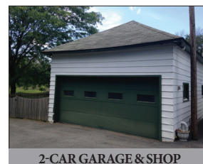
2-CAR GARAGE & SHOP

For photos & listing visit www.martinandrutt.com