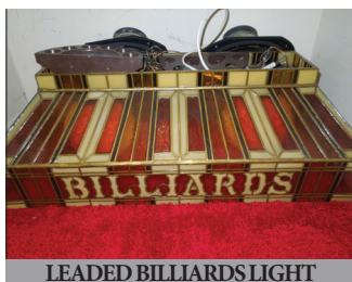
LEADED BILLIARDS LIGHT