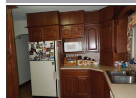
CUSTOM CHERRY KITCHEN