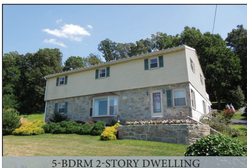
5-BDRM 2-STORY DWELLING