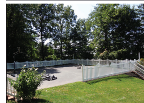
PAVED VOLLEYBALL COURT