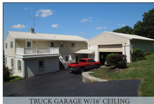
TRUCK GARAGE W/16' CEILING

Located at 1130 Sheep Hill Rd. New Holland, Pa. East Earl Twp. Lancaster Co.