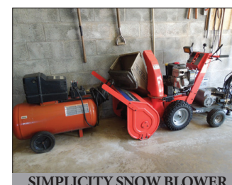
SIMPLICITY SNOW BLOWER