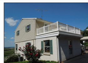
17'X12' BALCONY W/STEPS

For photos & listing visit www.martinandrutt.com