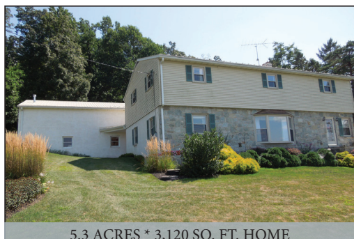
5.3 ACRES * 3,120 SQ. FT. HOME

5-BDRM 2-STORY DWELLING * TRUCK GARAGE * 5.3-AC. LOT 3-BATHS * CUSTOM KITCHEN * 3,120 Sq. Ft. AREA 04 FORD F-150 4x4 * HONDA ATV * JOHN DEERE X585 MOWER 17-GUNS * TOOLS * FURNITURE * PERSONAL PROPERTY SAT., SEPTEMBER 28, 2019 @ 9 AM/Real Estate @ 1 PM