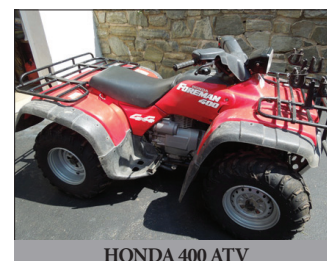
HONDA 400 ATV

PERSONAL PROPERTY: 4-pc dbl bdrm suite & bedding; dresser & chest; cedar chest; china hutch; 8-gun cabinet; rockers & recliners; treadmill; sofa; 2-TV stands; studio piano; pool table & accessories; leaded glass Billiards light (nice); quilts, blankets, quilters frame; milk bottles; SS stock pots; SS cookware; many kitchen & baking items; crocks & jugs; canner; fans; lamps; toy trucks-Winross & Ertl; plus much more not listed!.