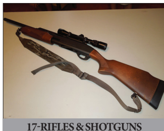
17-RIFLES & SHOTGUNS

5-BDRM 2-STORY DWELLING * TRUCK GARAGE * 5.3-AC. LOT 3-BATHS * CUSTOM KITCHEN * 3,120 Sq. Ft. AREA 04 FORD F-150 4x4 * HONDA ATV * JOHN DEERE X585 MOWER 17-GUNS * TOOLS * FURNITURE * PERSONAL PROPERTY SAT., SEPTEMBER 28, 2019 @ 9 AM/Real Estate @ 1 PM