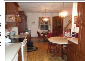
CUSTOM BREAKFAST NOOK