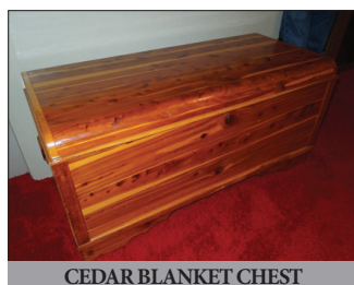
CEDAR BLANKET CHEST

LAWN, GARDEN & TOOLS: Honda Foreman 400 4x4 ATV & V-plow; John Deere X585 4x4 lawn tractor w/54" deck & power vac, hydrostatic, gas, dual remotes; Massey Ferguson cart; 2004 Hillsboro 8x5 open trailer; power lawn/leaf vac; 1000PSI pressure washer; Simplicity 10hp 24" snow blower ; Craftsman air compressor; scroll saw; belt/disc sander; 12' Werner step ladder; tool boxes; many hand tools; battery chargers; 2-shop vacs; wrench & socket sets; Stihl string trimmers; 2-1970's Raleigh Chopper 5-sp bikes; IH pedal tractor; Airplane (Atomic Missile) pedal toy; express wagon; Wheeling twin tubs; sled; pole saw; shovels, rakes, etc.;