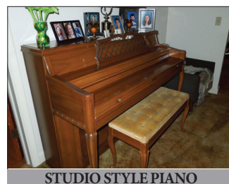
STUDIO STYLE PIANO

Terms: cash, PA check or credit card w/3% fee. Food stand provided; sale held under tent, bring a chair. All sale day announcements take precedence over any prior ads.