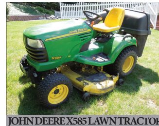
JOHN DEERE X585 LAWN TRACTOR

LAWN, GARDEN & TOOLS: Honda Foreman 400 4x4 ATV & V-plow; John Deere X585 4x4 lawn tractor w/54" deck & power vac, hydrostatic, gas, dual remotes; Massey Ferguson cart; 2004 Hillsboro 8x5 open trailer; power lawn/leaf vac; 1000PSI pressure washer; Simplicity 10hp 24" snow blower ; Craftsman air compressor; scroll saw; belt/disc sander; 12' Werner step ladder; tool boxes; many hand tools; battery chargers; 2-shop vacs; wrench & socket sets; Stihl string trimmers; 2-1970's Raleigh Chopper 5-sp bikes; IH pedal tractor; Airplane (Atomic Missile) pedal toy; express wagon; Wheeling twin tubs; sled; pole saw; shovels, rakes, etc.;