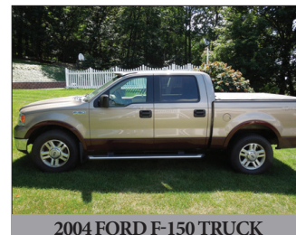
2004 FORD F-150 TRUCK

GUNS: J. Stevens .22 rifle; Winchester mod 61 .22 w/scope; .222 Remington mod 788 bolt-action w/4x scope; 20-ga. Western Field 3-chamber mod SB100B; Winchester 12-ga. pump mod 1300 w/vented rib; 20-ga. Remington 870 Express Magnum slug gun w/Weaver scope; Browning 12-ga. pump w/scope; 12-ga. Remington 870 Express Magnum slug gun w/ Weaver scope; Ithaca 16-ga. feather light pump mod 37; Winchester mod 12 16-ga. pump; Springfield 12-ga. dbl brl; Savage 16-ga. dbl brl Fox mod B; Remington 30.06 Gamemaster mod 760 pump w/Redfield 3x9 scope; Winchester .22 S/L mod 131 w/Weaver 4x scope; Remington mod 700 6mm w/Leupold 3x9 vari-scope (A6548757); Ruger .243 M77 Mark# w/Bushnell 3x9 scope, youth gun, (788-45960) Savage semi-auto 12-ga. (254645); lots of misc ammo; nice gun cases; clay birds; compound bow; fishing rod; misc hunting related items. (GUNS NOT ON PREMISES TILL SALE DAY!)