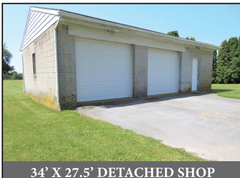
34' X 27.5' DETACHED SHOP