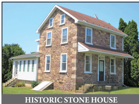
HISTORIC STONE HOUSE