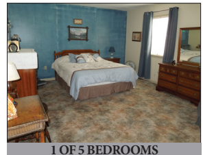
1 OF 5 BEDROOMS