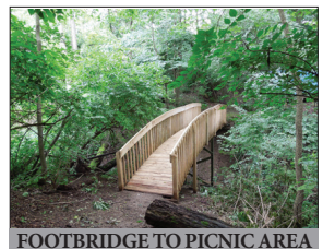
FOOTBRIDGE TO PICNIC AREA

OPEN HOUSE: SAT. JULY 20 & 27 from 1-3 PM for info call auctioneer @ (717) 371-3333.