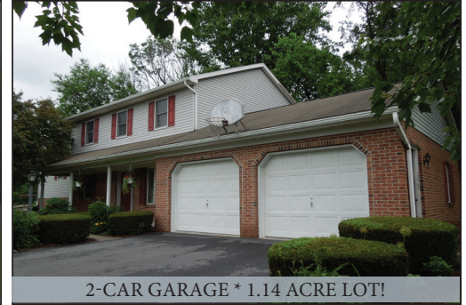
2-CAR GARAGE * 1.14 ACRE LOT!

Located at 123 Esbenshade Dr. Lititz, Pa. Elizabeth Twp. Lancaster Co.