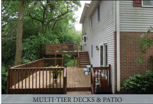
MULTI-TIER DECKS & PATIO