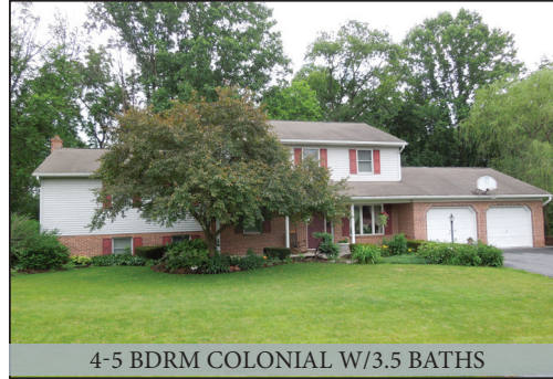
4-5 BDRM COLONIAL W/3.5 BATHS