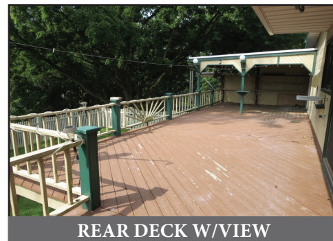
REAR DECK W/VIEW

Located at: 902 Grandview Dr. Akron Pa 17501