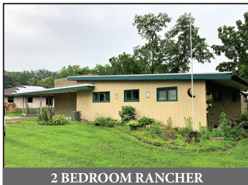
2 BEDROOM RANCHER