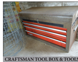
CRAFTSMAN TOOL BOX & TOOLS