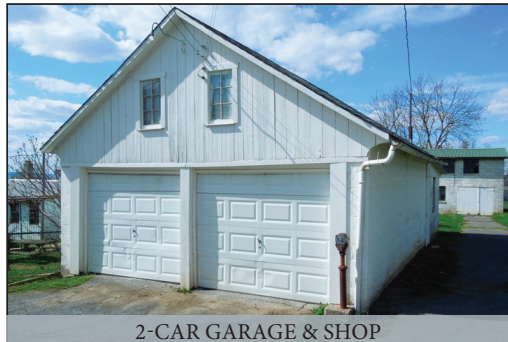
2-CAR GARAGE & SHOP

SAT. AUG. 24, 2019 @ 8-AM / Real Estate @ 1-PM