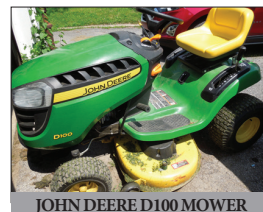
JOHN DEERE D100 MOWER

Terms: cash, PA check or credit card w/3% fee; sale held under tent, bring a chair; food by WVFC aux.; all sale day announcements take precedence over any prior ads.