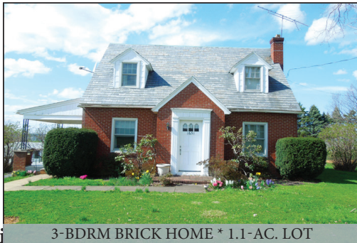
3-BDRM BRICK HOME * 1.1-AC. LOT