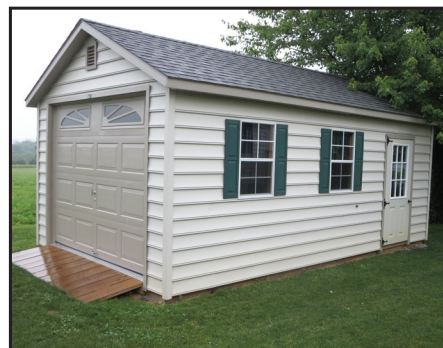
12'X 20' SHED (11-2017)

Located at: 328 E. Mohler Church Rd. Ephrata Pa. 17522