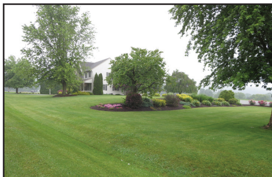
HUGE SIDE YARD