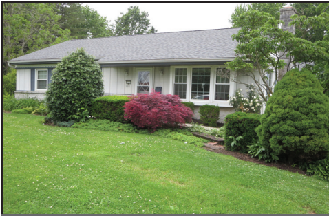
CLEAN 3-5 BR RANCHER

CHARMING RANCHER * 3 or 5 BEDROOMS HALF ACRE LEVEL LOT * 2-CAR ATTACHED GARAGE FINISHED BASEMENT * 2 KITCHENS * CLEAN TUESDAY, JULY 2, 2019 @ 6:30 PM