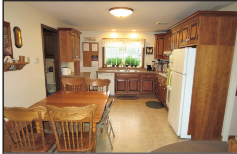
LARGE EAT-IN KITCHEN