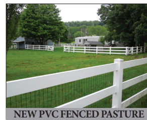
NEW PVC FENCED PASTURE

OPEN HOUSE: SAT. JUNE 22 from 1-3 PM for info call auctioneer @ (717) 371-3333