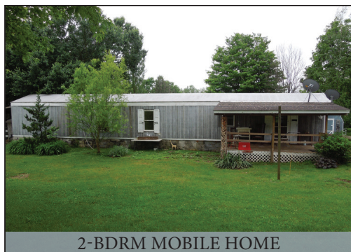
2-BDRM MOBILE HOME