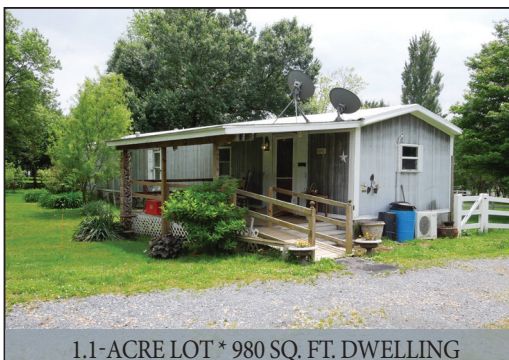
1.1-ACRE LOT * 980 SQ. FT. DWELLING