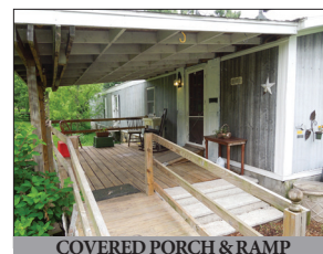
COVERED PORCH & RAMP