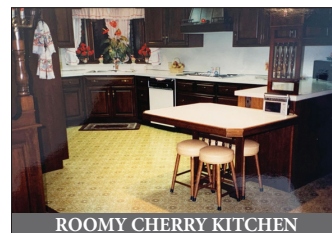
ROOMY CHERRY KITCHEN

DETACHED GARAGE: A 60'x 30' concrete block detached garage; has 4 overhead garage doors; concrete floor; water & electric; roomy 2-level work shop & storage area; great for storage or the car enthusiast; 24'x 12' sheep barn (poor condition) w/ sheep/pony pasture area; some wooded area; zoned Residential; W. Cocalico Twp; desirable Cocalico School District.