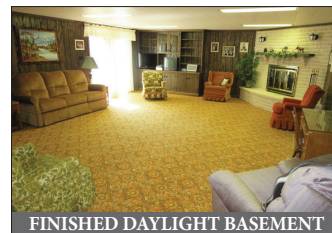
FINISHED DAYLIGHT BASEMENT

1-ACRE LOT: A 1 acre lot that is all wooded; land locked; some timber value; good hunting; small stream; zoned residential; total taxes approx. $348.00; parcel #0907202500000; sold immediately following the house.