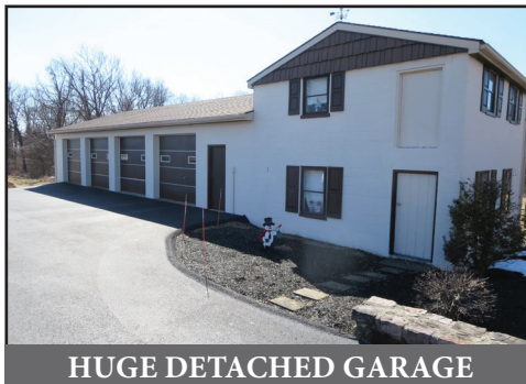
HUGE DETACHED GARAGE