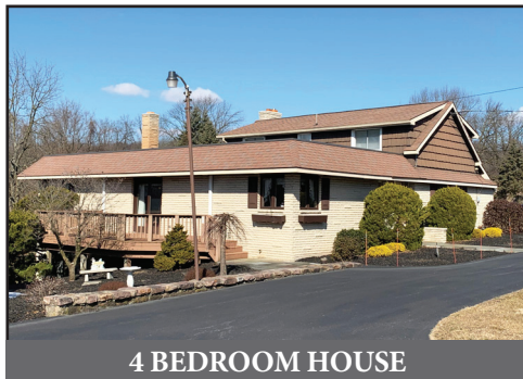
4 BEDROOM HOUSE

SATURDAY, JUNE 8, 2019 @ 8:30 AM / REAL ESTATE @ 1:00 PM