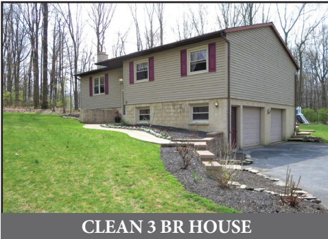
CLEAN 3 BR HOUSE

1-ACRE WOODED LOT * 3 BEDROOMS * NICE 2 CAR ATTACHED GARAGE * NEW HEAT & A/C THURSDAY, JUNE 27, 2019 @ 6:00 PM