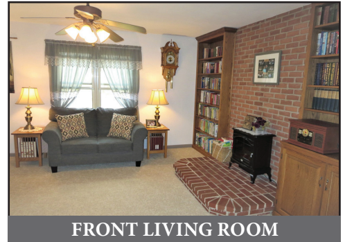
FRONT LIVING ROOM

Located at: 594 Sandmine Rd. New Holland, Pa. 17557