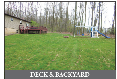
DECK & BACKYARD

REAL ESTATE DETAILS: A very clean 3 bedroom house w/ 2 car attached garage on 1 acre wooded lot. Bi-Level style house has approx. 1,780 sq. ft. of finished area; huge eat-in kitchen w/ abundant cabinetry & built-in appliances (sink window overlooks back yard); front family room w/ brick hearth for wood stove, built-in Oak bookcases, large front window; Master bedroom & closet; full Master bathroom; 2 additional bedrooms w/ closets; full common bathroom; 20'x 18' treated wood rear deck; adirondack banister for steps; lower level has roomy living room w/ stone hearth for wood stove; full bathroom; laundry room; over-sized 2 car garage; new elec. heat pump & A/C in 2018; on-site well & septic; gutter guard; 2015 20'x 10' storage barn; zoned Residential; desirable East Earl Twp.; reasonable total taxes are approx. $3,211.00; sellers are moving out of the area and are serious about selling, come prepared to buy at auction.