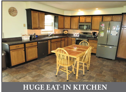
HUGE EAT-IN KITCHEN