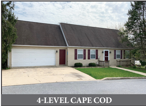
4-LEVEL CAPE COD