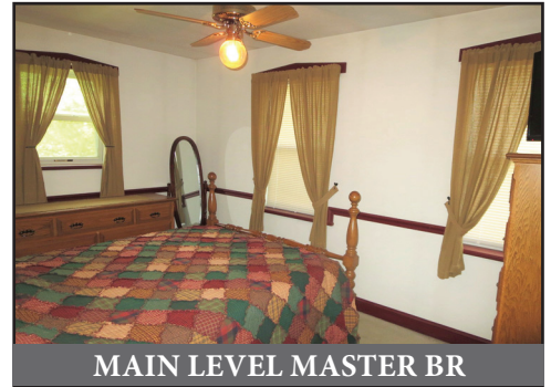
MAIN LEVEL MASTER BR

Located at: 18 Lauren Lane Ephrata Pa. 17522