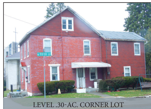
LEVEL .30-AC. CORNER LOT