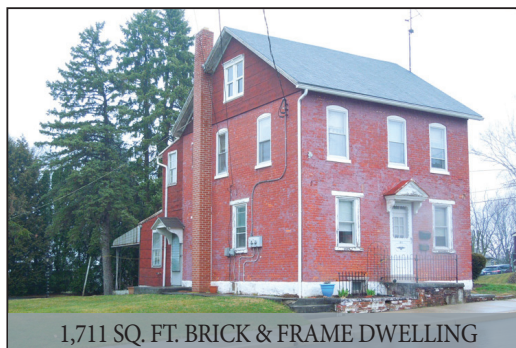
1,711 SQ. FT. BRICK & FRAME DWELLING