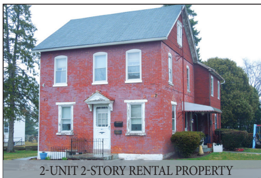
2-UNIT 2-STORY RENTAL PROPERTY