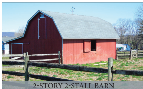
2-STORY 2-STALL BARN

3-BDRM CUSTOM STONE RANCHER & BARN * 3.5 ACRES! TRACTORS * ANTIQUES * TOOLS * PERSONAL PROPERTY SATURDAY, JUNE 22, 2019 @ 9 AM/Real Estate @ 1-PM