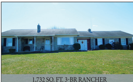
1,732 SQ. FT. 3-BR RANCHER