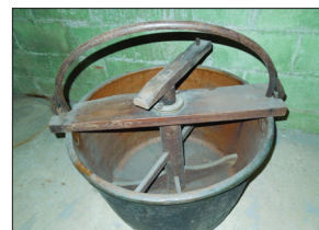
LARGE COPPER KETTLE

TERMS: Cash, PA check or credit card w/3% fee; food by Farmersville FC aux.; sale held under tent bring a chair; all sale day announcements take precedence over prior ads.