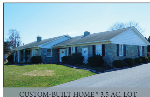
CUSTOM-BUILT HOME * 3.5 AC. LOT

Located at 184 Wanner Rd. Ephrata, Pa, Earl Twp. Lancaster Co.