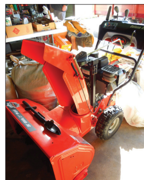
ARIENS 28" SNOW BLOWER