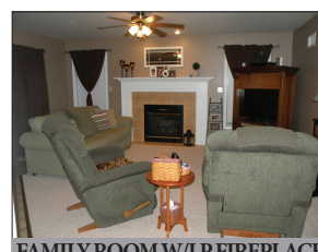
FAMILY ROOM W/LP FIREPLACE