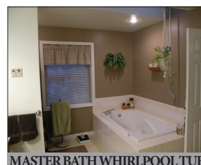
MASTER BATH WHIRLPOOL TUB