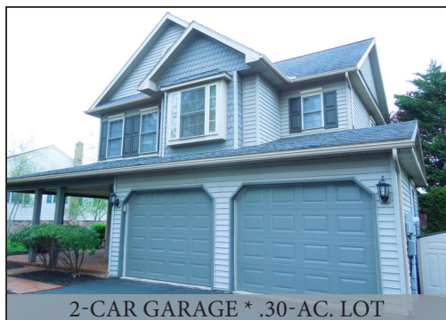
2-CAR GARAGE * .30-AC. LOT