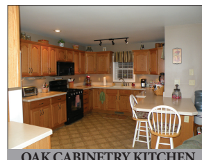
OAK CABINETRY KITCHEN