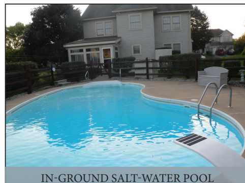
IN-GROUND SALT-WATER POOL

Located at 1208 Grants Place, Denver, Pa. Brecknock Twp. Lancaster Co.