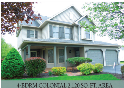
4-BDRM COLONIAL 2,120 SQ. FT. AREA