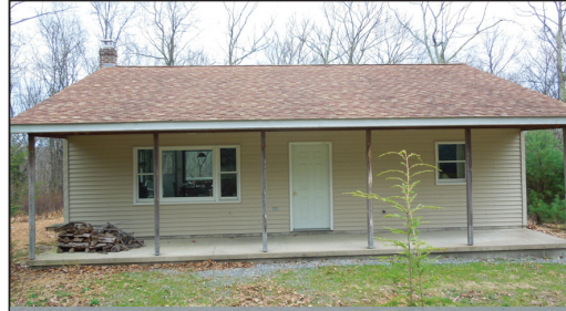
2-BR CABIN * 68-WOODED ACRES!