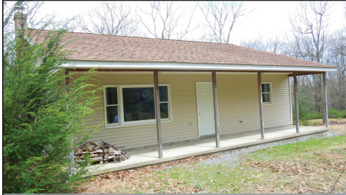
36' COVERED FRONT PORCH