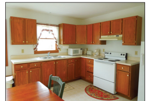
MODERN KITCHEN & APPLIANCES

For photos & listing visit www.martinandrutt.com