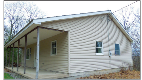
NEW 1997-SELLS FURNISHED

Located at 1960 Jones Mtn. Rd. Mifflinburg, Pa. Lewis Twp. Union Co.