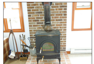
EFFICIENT WOOD STOVE