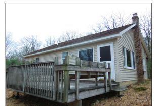
REAR DECK W/SEATING