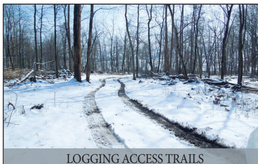
LOGGING ACCESS TRAILS