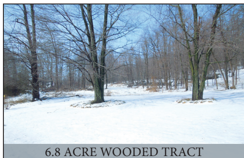
6.8 ACRE WOODED TRACT