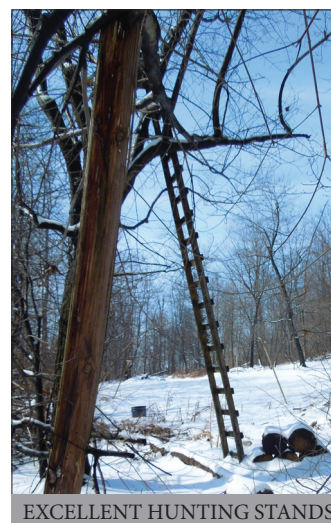
EXCELLENT HUNTING STANDS

**PROPERTY INSPECTION ANYTIME** for info call auctioneer @ (717) 371-3333