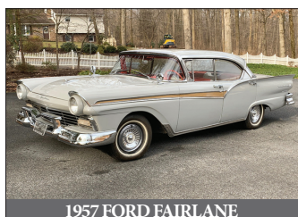
1957 FORD FAIRLANE