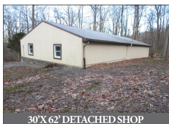
30'X62' DETACHED SHOP

Located at: 156 E. Mohler Church Rd. Ephrata, Pa. 17522