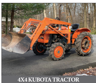
4X4 KUBOTA TRACTOR