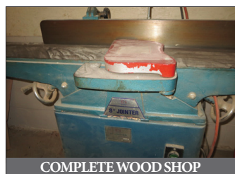
COMPLETE WOOD SHOP