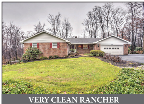
VERY CLEAN RANCHER