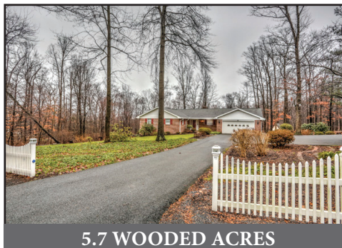
5.7 WOODED ACRES