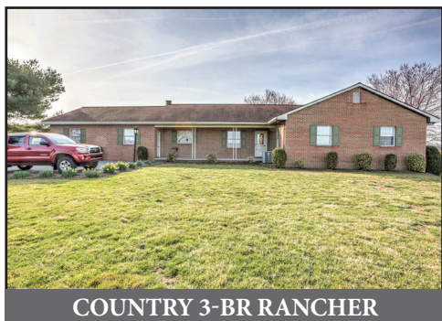
COUNTRY 3-BR RANCHER