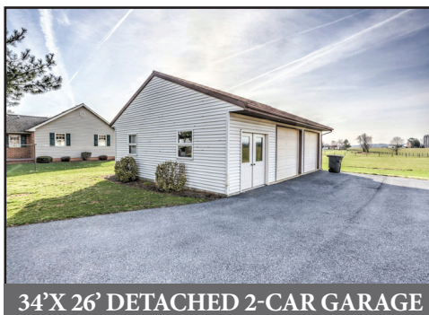
34'X 26' DETACHED 2-CAR GARAGE