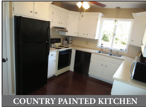
COUNTRY PAINTED KITCHEN