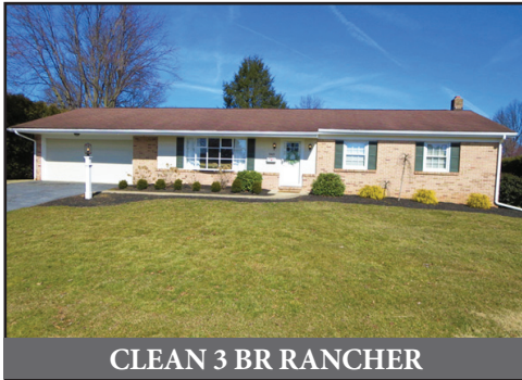
CLEAN 3 BR RANCHER