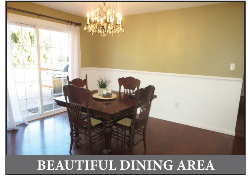
BEAUTIFUL DINING AREA

Located at: 945 Fairview Dr. Ephrata Pa.