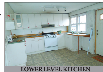
LOWER LEVEL KITCHEN