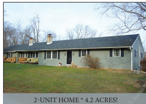
2-UNIT HOME * 4.2 ACRES!

Located at: 21 Highspire Rd. (Village of Lyndell) Downingtown, Pa. E. Brandywine Twp.