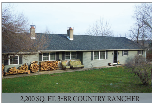
2,200 SQ. FT. 3-BR COUNTRY RANCHER