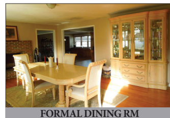
FORMAL DINING RM