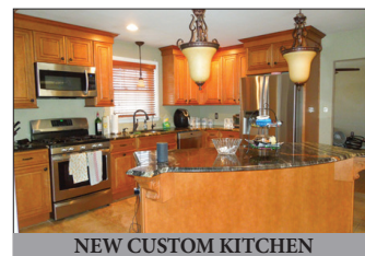
NEW CUSTOM KITCHEN

For photos & listing visit www.martinandrutt.com