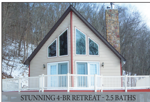
STUNNING 4-BR RETREAT - 2.5 BATHS