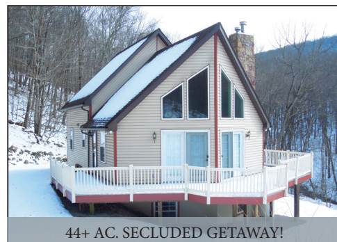
44+ AC. SECLUDED GETAWAY!

Located at: 268 Bixler Gap Rd. Lewistown, Pa. Granville Twp. Mifflin Co.