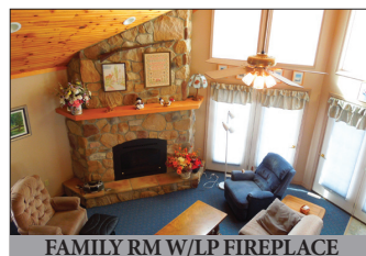
FAMILY RM W/LP FIREPLACE