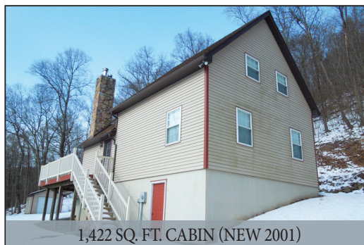
1,422 SQ. FT. CABIN (NEW 2001)