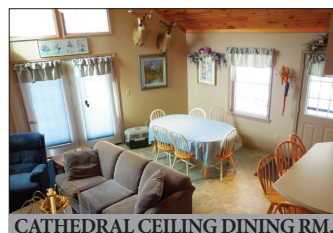
CATHEDRAL CEILING DINING RM.