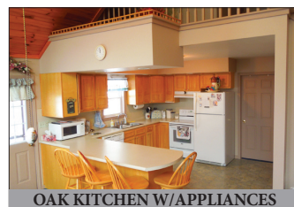
OAK KITCHEN W/APPLIANCES

For photos & listing visit www.martinandrutt.com