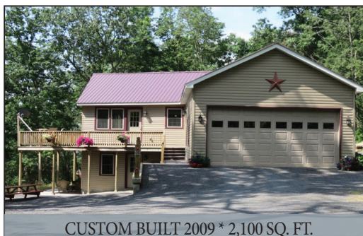
CUSTOM BUILT 2009 * 2,100 SQ. FT.