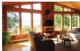
MAIN FLOOR GREAT ROOM