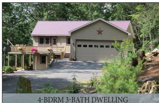
4-BDRM 3-BATH DWELLING