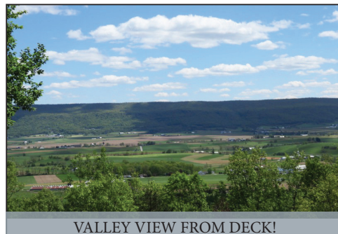
VALLEY VIEW FROM DECK!

Located at: 262 Lower Stone Mtn. Ln. Belleville, Pa. Union Twp. Mifflin Co.