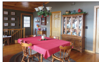
MAIN FLOOR DINING RM.