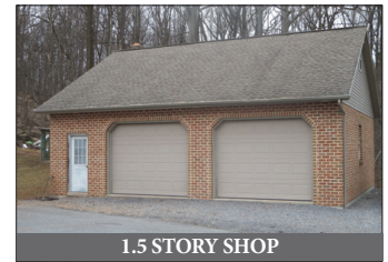
1.5 STORY SHOP

REAL ESTATE DETAILS: A nice 2-story colonial has 4 bedrooms w/ 2-car attached garage & 34'x 30' detached 2-car garage on 9.8 acre wooded lot, (room to park semi-truck). Main level has a huge 26'x13' eat-in kitchen w/ abundant custom Cherry cabinetry, island w/ inset stove top, large pantry, sink window overlooking backyard, new vinyl flooring, new patio doors to rear wooded patio; 19'x 16' family room w/ beautiful brick wood burning fireplace & new patio doors to small brick patio; 15'x 12' living room/office room; front foyer w/ tile flooring & huge coat closet; laundry room w/ cabinetry storage & laundry sink out to small brick patio; powder bathroom; oversized 2-car garage has plenty of storage; 12'x 8.5' hobby-room; charming covered front porch; lots of chairs-rail trim thru-out. Second level has 15'x 13 Master bedroom; full master bathroom w/ tub shower; his/her master closets; 3 additional bedrooms all w/ closet storage; full common bathroom w/ tub shower; huge hall closet; whole house fan. Basement has large finished living room w/ brick hearth for wood/coal stove; full bathroom has shower stall; utility room; outside Bilco steps; 200 amp electric service; 8' Superior pre-fab basement walls; new elec. water heater; central vac. system; water softener; elec. heat pump & central A/C; E. Cocalico Twp.; Cocalico School District; taxes are approx.