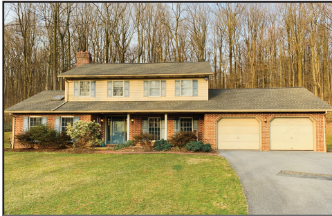
LARGE 2-STORY HOUSE