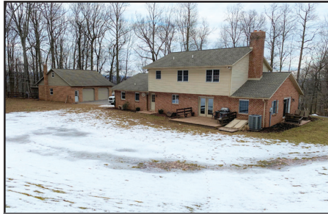
BACK OF HOUSE * YARD