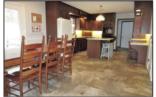
HUGE EAT-IN KITCHEN

Located at: 195 E. Church St. Stevens Pa. 17578