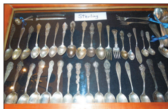
LOTS OF STERLING SILVER

For photos & listing visit www.martinandrutt.com