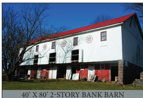
40' X 80' 2-STORY BANK BARN

16.69 AC. FARM w/1,800's 4-BR STONE FARMHOUSE * SUMMER HOUSE 2-SPRING HOUSES & POND * 40'x80' 2-STORY FRAME BANK BARN CASE IH 35A 4WD TRACTOR (100hrs) * CASE 1845C SKIDLOADER * '78-JEEP J10 VALUABLE ANTIQUES * FURNITURE * GLASSWARE * STERLING SILVER SATURDAY, APRIL 27, 2019 @ 9-AM/Real Estate @ 1-PM