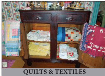
QUILTS & TEXTILES