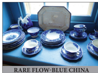
RARE FLOW-BLUE CHINA