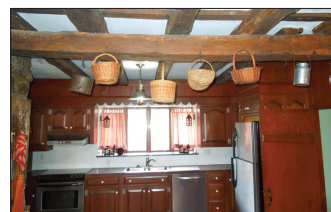
CUSTOM CHERRY KITCHEN

TERMS: 10% down day of sale, balance on or before 60 days. Attorney: Kling & Deibler (717) 354-7700.