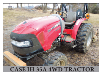
CASE IH 35A 4WD TRACTOR