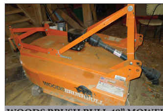
WOODS BRUSH BULL 48" MOWER