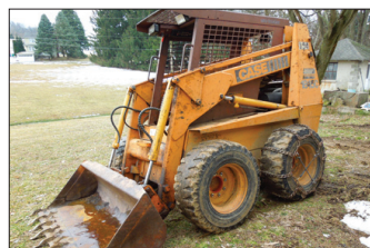
CASE 1845C SKIDLOADER