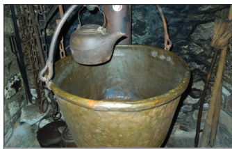
LARGE BRASS KETTLE