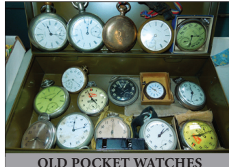
OLD POCKET WATCHES