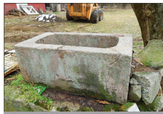
SANDSTONE WATER TROUGH