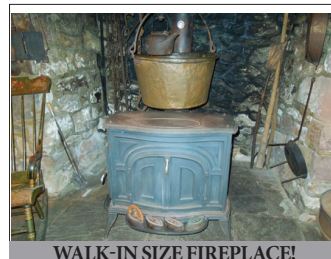
WALK-IN SIZE FIREPLACE!

NOTE: Outstanding historic Berks Co. farm, rich character throughout; large bank barn; horses ok; 4-ac. wooded; 8+ac. tillable great produce or hobby farm; conveniently located 1-mi. from Rt. 222.