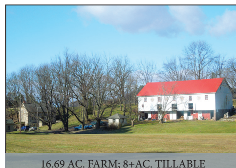
16.69 AC. FARM; 8+AC. TILLABLE

Located at 231 Wheatfield Rd. Sinking Spring, Pa. Spring Twp. Berks Co.