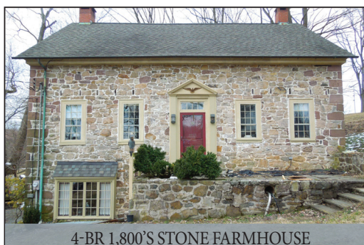
4-BR 1,800'S STONE FARMHOUSE