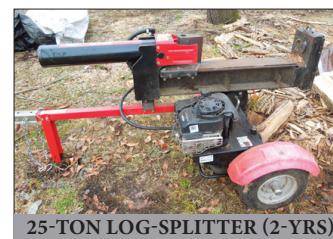
25-TON LOG-SPLITTER (2-YRS)