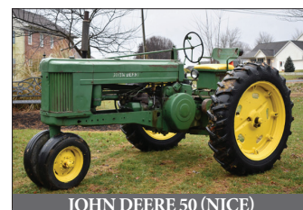
JOHN DEERE 50 (NICE)