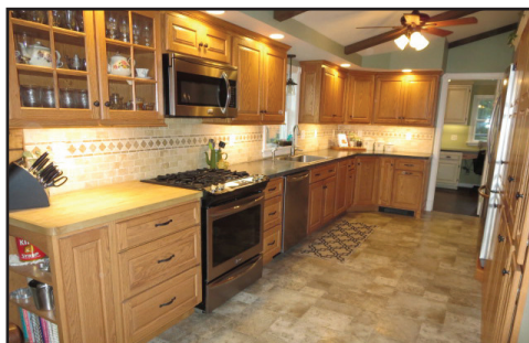
IMPRESSIVE NEW KITCHEN