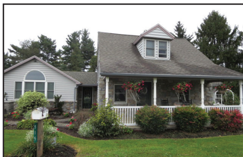
CLEAN & UPDATED CAPE COD