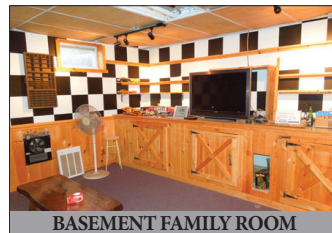
BASEMENT FAMILY ROOM