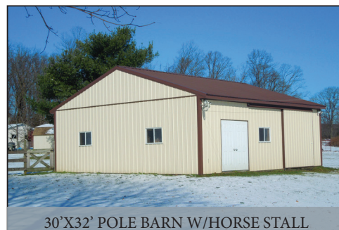
30'X32' POLE BARN W/HORSE STALL

Located at 5855 Mast Rd. Narvon, Pa. Salisbury Twp. Lancaster Co.