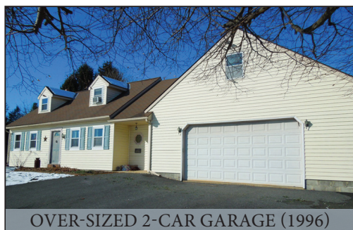
OVER-SIZED 2-CAR GARAGE (1996)

* Snow Date: Thurs. March 14, 2019 @ 5-pm *