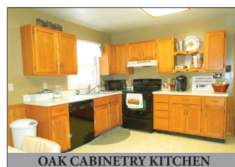
OAK CABINETRY KITCHEN

For photos & listing visit www.martinandrutt.com