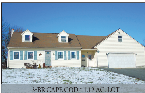
3-BR CAPE COD * 1.12 AC. LOT