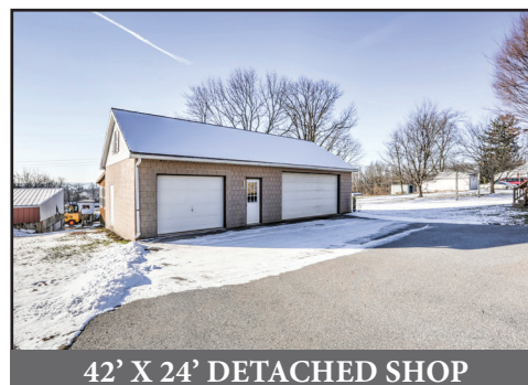
42' X 24' DETACHED SHOP

AUCTIONEER NOTE: Great opportunity to buy two properties at one auction. Each property has its own deed. Properties are side-by-side and have some shared improvements. Each has its own water well, but they are linked together for water quality. Both have individual septic systems, but they are linked together (if one would have a problem, both properties could use one system); West Cocalico Twp; Cocalico School District. Both houses are in very nice & turn-key ready. Live in one and use second house for additional income.