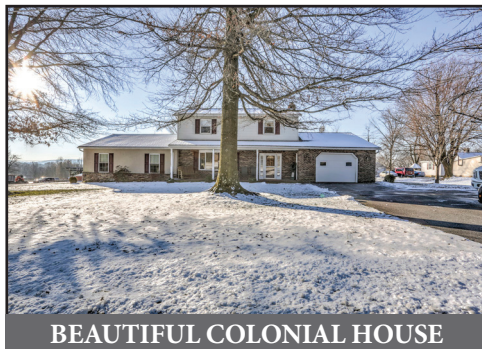
BEAUTIFUL COLONIAL HOUSE