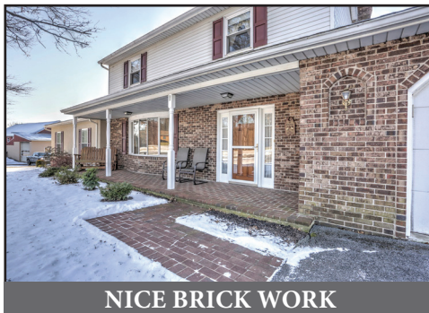
NICE BRICK WORK