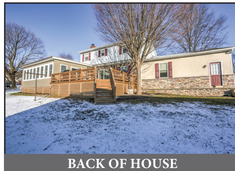
BACK OF HOUSE

Located at: 345 Hartings Park Rd. * 300-A S. Cocalico Rd. Unit-A (both) Denver Pa.