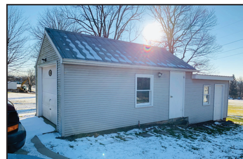
PROPERTY #2 (DETACHED SHOP)