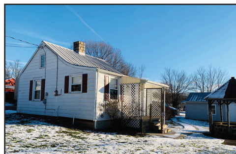
PROPERTY #2 (2-BR. RANCHER)