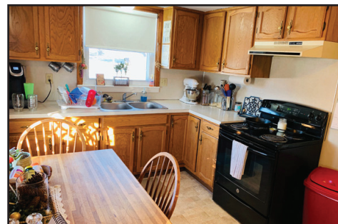
PROPERTY #2 (EAT-IN KITCHEN)