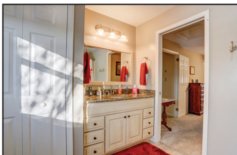
FULL MASTER BATH