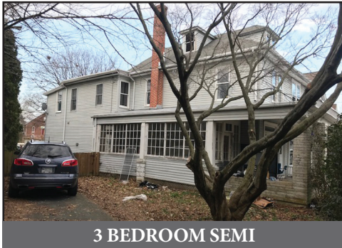
3 BEDROOM SEMI