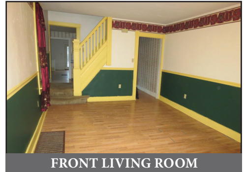
FRONT LIVING ROOM

Located at: 284 W. Franklin St. Ephrata Pa. 17522