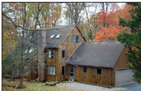
UNFINISHED TIMBERFRAME HOUSE