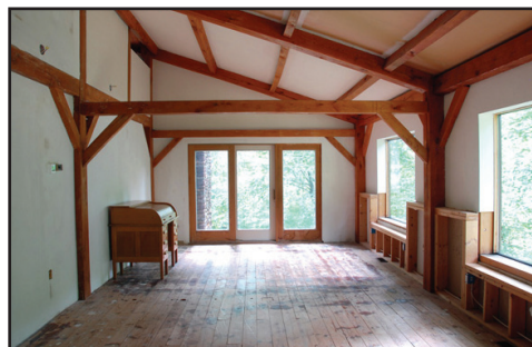
POST & BEAM STYLE

Located at: 29 James Rd. Reinholds Pa 17569