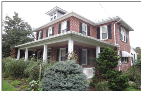
4 BR COLONIAL