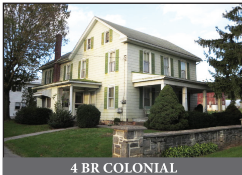
4 BR COLONIAL