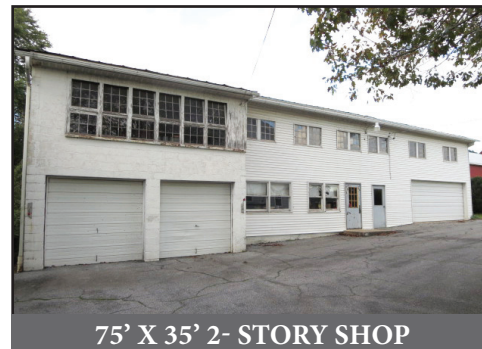
75' X 35' 2- STORY SHOP

Located at: 34 East Farmersville Rd. Ephrata Pa. 17522