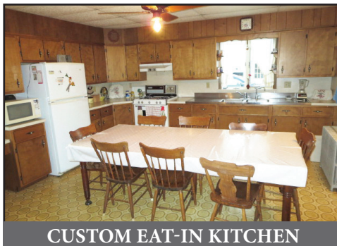
CUSTOM EAT-IN KITCHEN