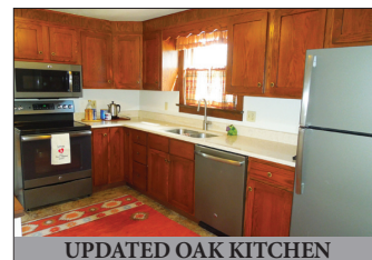
UPDATED OAK KITCHEN

REAL ESTATE: features a 2-bedroom 1,200 sq. ft. dwelling w/1-car garage on a .50-ac. lot. Main floor includes a 12'x12' living room w/laminate wood flooring; updated custom oak cabinetry kitchen w/quartz counter-tops; laminate tile flooring, stainless steel appliances included; 15'x18' dining room/family room w/cathedral ceiling; lots of natural lighting & oak floors; 6'x15' private rear deck; 2-bedrooms & full bath; lower level includes a 15'x20' sunroom/rec room; utility room; laundry area & 1-car garage; walk-up attic storage, possible 3rd bedroom; recent heat pump/central AC; public water & sewer; annual taxes: $2,519.