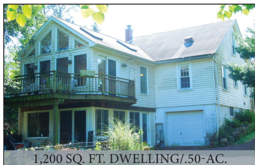
1,200 SQ. FT. DWELLING/.50-AC.

2-BDRM 1.5 STORY DWELLING * .50-ACRE LOT 1,200 Sq. Ft. * NEW CUSTOM KITCHEN * 1-CAR GARAGE TUESDAY, NOVEMBER 13, 2018 @ 4:00 PM