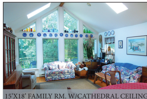
15'X18' FAMILY RM. W/CATHEDRAL CEILING

Located at 170 E. Pine St. Ephrata, Pa. 17522