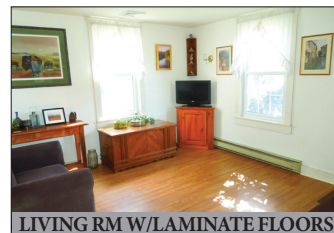
LIVING RM W/LAMINATE FLOORS

OPEN HOUSE: SAT. OCT. 20 & NOV. 3 from 1-3 PM for info call auctioneer @ (717) 371-3333.