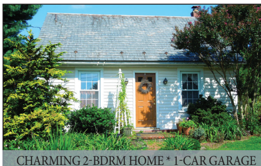
CHARMING 2-BDRM HOME * 1-CAR GARAGE