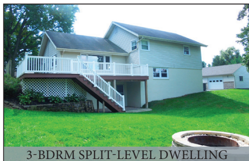
3-BDRM SPLIT-LEVEL DWELLING