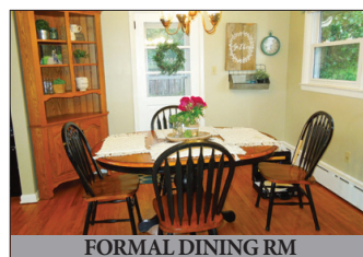
FORMAL DINING RM