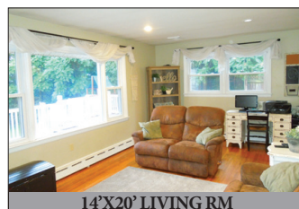
14'X20' LIVING RM