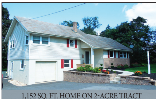
1,152 SQ. FT. HOME ON 2-ACRE TRACT