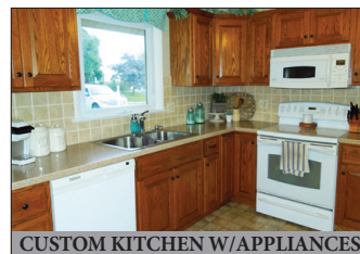
CUSTOM KITCHEN W/APPLIANCES

For photos & listing visit www.martinandrutt.com