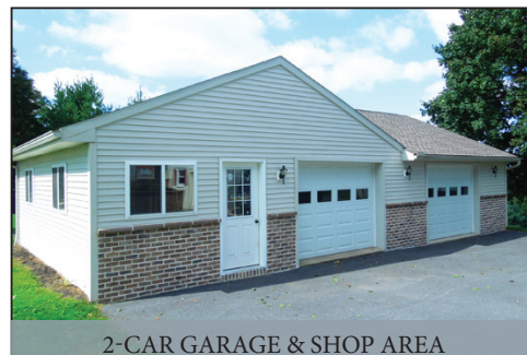
2-CAR GARAGE & SHOP AREA

Located at 120 Scenic View Dr. Ephrata, Pa. Ephrata Twp. Lancaster Co.