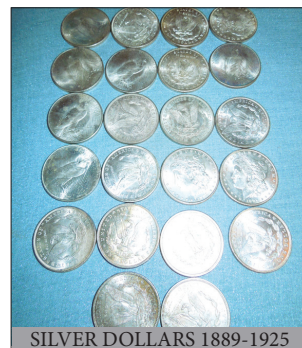
SILVER DOLLARS 1889-1925