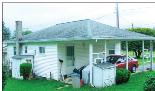
3-BDRM, 1-BATH, 1-STORY HOME

SAT. NOV. 10, 2018 @ 9-AM /Real Estate @ 12:30 PM