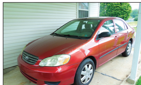
2003 TOYOTA COROLLA LE * 140K MI

Located at 216 S. Manor St. Mountville, Pa.