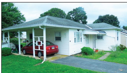
CUSTOM BUILT 1954 COTTAGE * .26-AC.