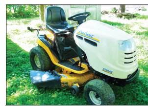
CUB CADET TRACTOR

TERMS: Cash, PA check or credit card w/3% admin fee. Food stand provided; sale held under tent, bring a chair. All sale day announcements take precedence over any prior ads.