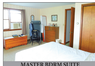
MASTER BDRM SUITE