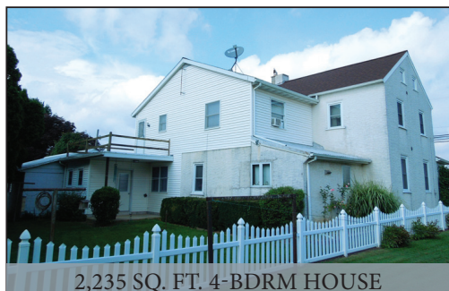
2,235 SQ. FT. 4-BDRM HOUSE

4-BDRM 2-STORY DWELLING w/2-CAR GARAGE * .26-AC. LOT 2,235 Sq. Ft. * CUSTOM KITCHEN * 26'x22' BARN/GARAGE THURSDAY, NOVEMBER 1, 2018 @ 5:00 PM