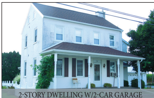
2-STORY DWELLING W/2-CAR GARAGE