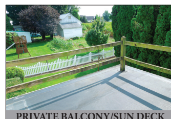
PRIVATE BALCONY/SUN DECK

OPEN HOUSE: SAT. OCT. 13 & 27 from 1-3 PM for info call auctioneer @ (717) 371-3333