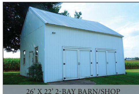
26' X 22' 2-BAY BARN/SHOP

Located at 334 Wissler Rd. New Holland, Pa. (Voganville) Earl Twp. Lancaster Co.